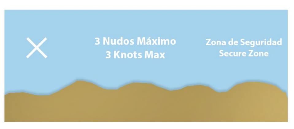
Tramo de la costa / Stretch of coast